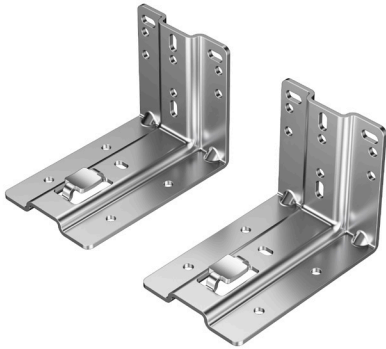
Metal rear bracket