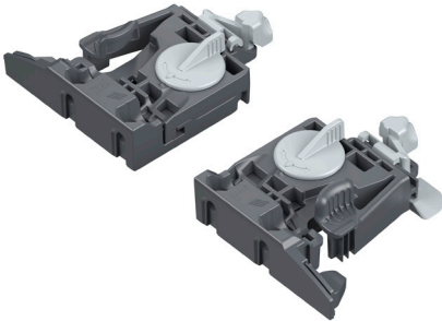
2D front mount 5/8"