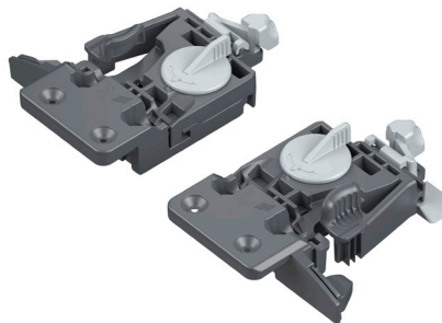
2D top mount 5/8"