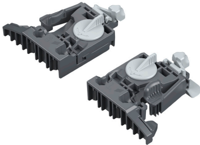
2D front mount 1/2"